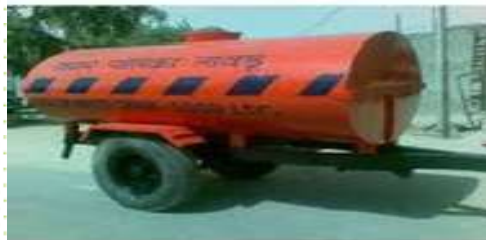
Tank for Water & Milk Tanker