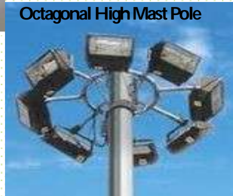
Octagonal High Mast Pole