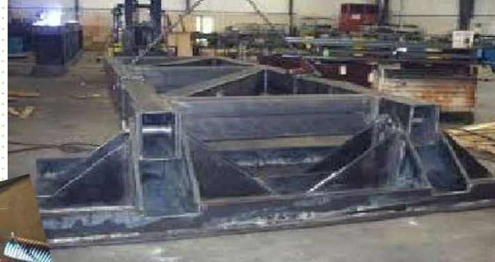
FRONT PART PROTO DEVELOPMENT