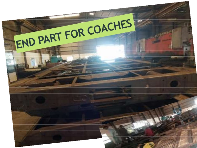
END PART FOR COACHES