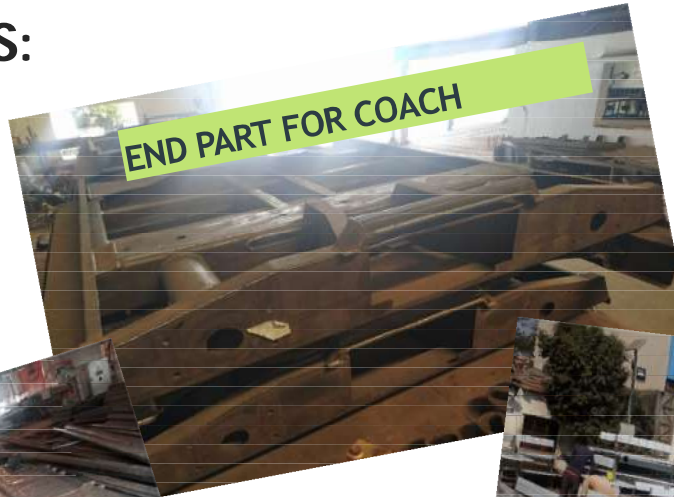
END PART FOR COACH