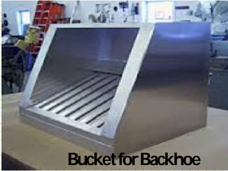
Bucket for Backhoe