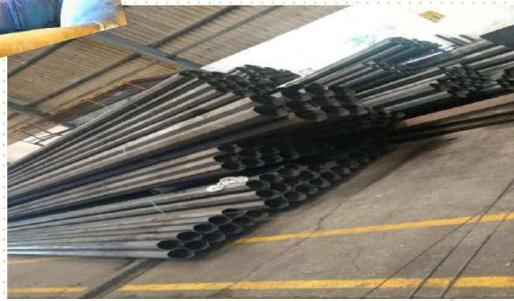
POLE STACKING AFTER FABRICATION