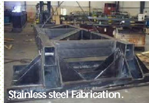
Stainless steel Fabrication.