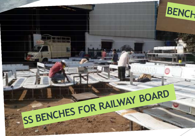
BENCHES READY FOR DISPATCH