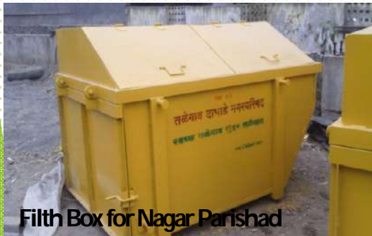
Filth Box for Nagar Parishad